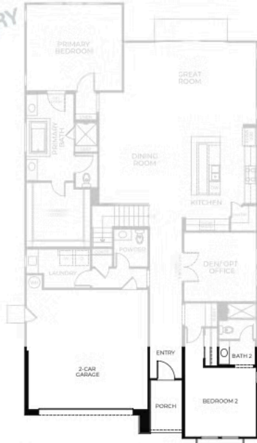
FIRST FLOOR - ELEVATION B