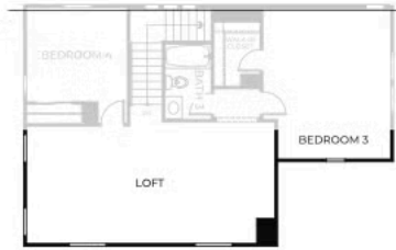
SECOND FLOOR - ELEVATION C

Preliminary and subject to change. 909-570-8617 | ShadyViewSales@TrumarkHomes.com | 18189 Via La Cresta, Chino Hills, CA 91709 | VIP-SHADYVIEW.COM