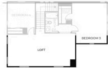
SECOND FLOOR - ELEVATION B

Preliminary and subject to change. 909-570-8617 | ShadyViewSales@TrumarkHomes.com | 18189 Via La Cresta, Chino Hills, CA 91709 | VIP-SHADYVIEW.COM