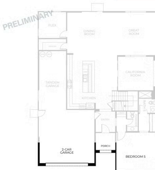
FIRST FLOOR - ELEVATION E

5 Bedrooms • 5.5 Baths • Flex Room • Loft • California Room • 2-Car Garage with Tandem Garage Approx. 3,923 Finished Sq. Ft.