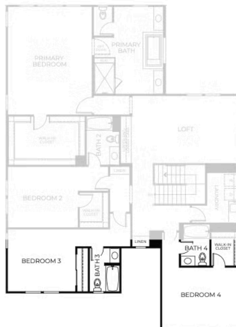
SECOND FLOOR - ELEVATION E

Preliminary and subject to change. 909-570-8617 | ShadyViewSales@TrumarkHomes.com | 18189 Via La Cresta, Chino Hills, CA 91709 | VIP-SHADYVIEW.COM