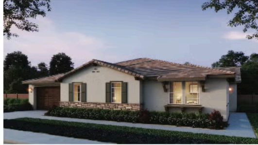
ELEVATION A – ADOBE RANCH

3 Bedrooms · 3.5 Baths · Play Room · California Room · 3-Car Tandem Garage Approx. 3,100 Finished Sq. Ft.