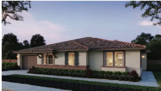
ELEVATION B – SPANISH COLONIAL