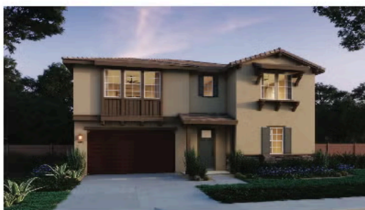
ELEVATION A – ADOBE RANCH

5 Bedrooms • 4 Baths • Loft • California Room • 3-Car Tandem Garage Approx. 3,119 Finished Sq. Ft.