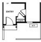
FIRST FLOOR RATIO LOW WALL (BUILDINGS 2, 3, AND 4)