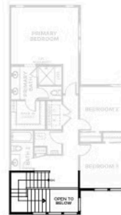
SECOND FLOOR - HIGH COUNTRY RANCH

Preliminary and subject to change. 720.802.6221 | SterlingRanchSales@trumarkco.com | 7046 Watercress Drive, Littleton CO | VIP-STERLINGRANCH.COM