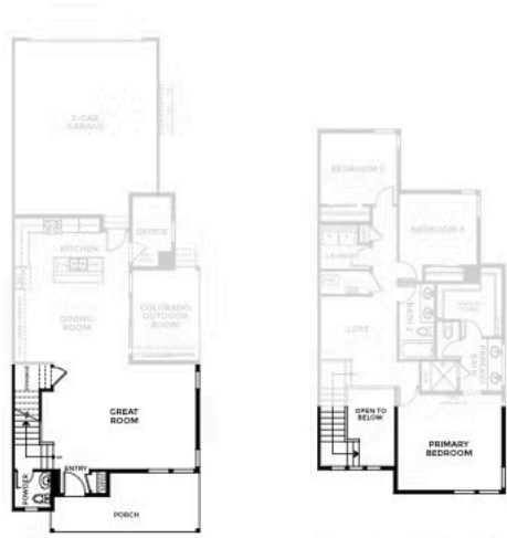
FIRST FLOOR - HIGH COUNTRY RANCH