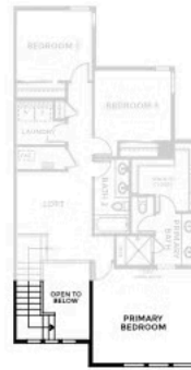
SECOND FLOOR - COLORADO PRAIRIE

Preliminary and subject to change. 720.802.6221 | SterlingRanchSales@trumarkco.com | 7046 Watercress Drive, Littleton CO | VIP-STERLINGRANCH.COM