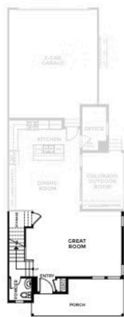
FIRST FLOOR - COLORADO PRAIRIE