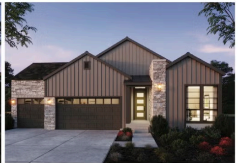
Elevation 2C - Modern Mountain

970.450.5504 | KitchelLakeSales@trumarkco.com | 1432 Alyssa Drive, Timnath, CO 80547 | VIP-KITCHEL.COM