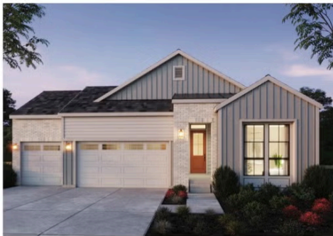
Elevation 2A - Modern Farmhouse

3 – 4 Bedrooms • 2.5 – 3.5 Baths • 3-Car Garage Approx. 2,228 – 3,184 Finished Sq. Ft.