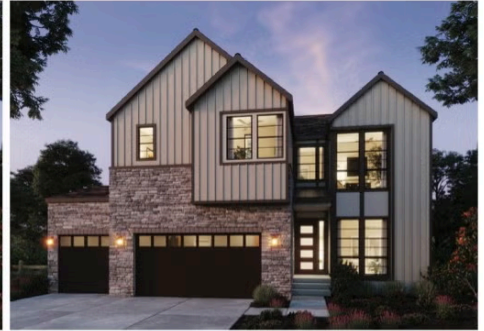
Elevation 3C - Modern Mountain

970.450.5504 | KitcheLakeSales@trumarkco.com | 1432 Alyssa Drive, Timnath, CO 80547 | VIP-KITCHEL.COM