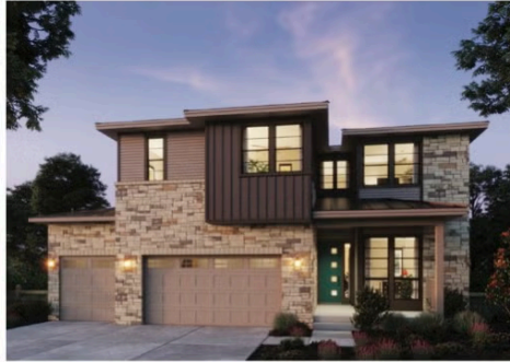
Elevation 3B - Modern Prairie