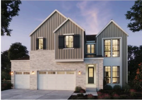
Elevation 3A - Modern Farmhouse

4 - 6 Bedrooms · 3 - 4 Baths · 4-Car Garage (Tandem) 2,768 - 3,733 Finished Sq. Ft.