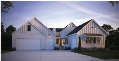
ELEVATION A - MODERN FARMHOUSE