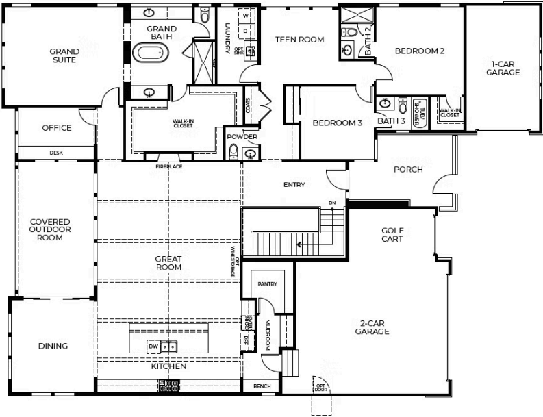
FIRST FLOOR Approx. 3,001 Sq. Ft.