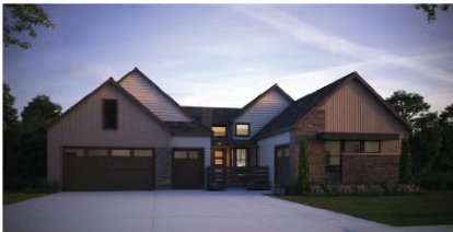
ELEVATION C - MODERN MOUNTAIN