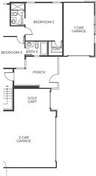
ELEVATION C FIRST FLOOR