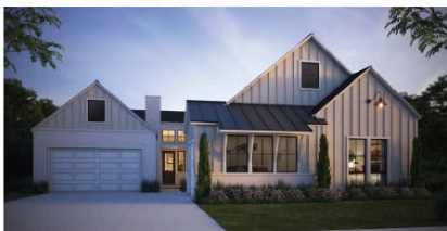
ELEVATION A - MODERN FARMHOUSE