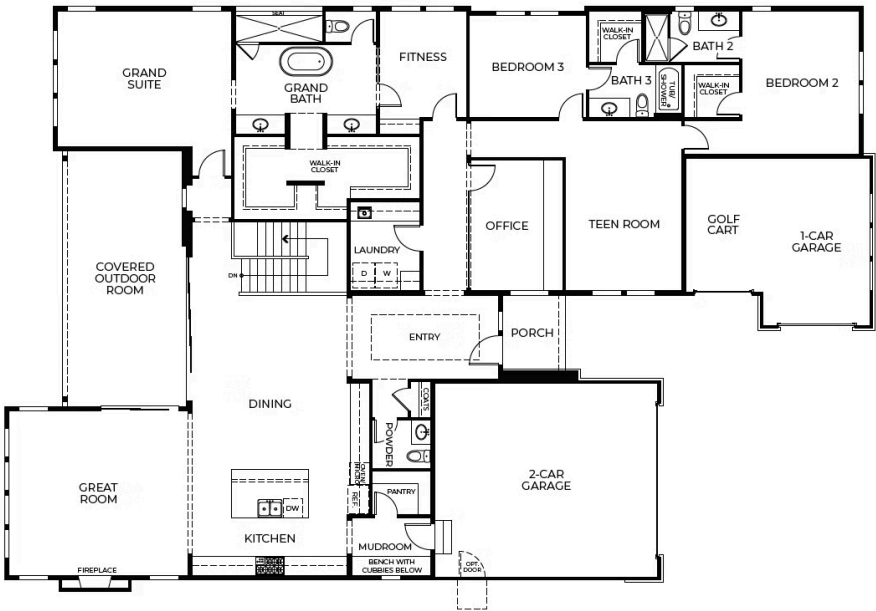
FIRST FLOOR Approx. 3,125 Sq. Ft.