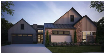
ELEVATION C - MODERN MOUNTAIN